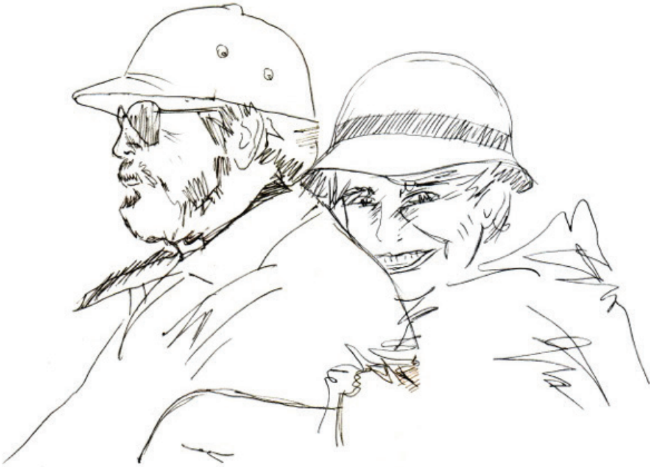
— Sketches by Darlene Lowe